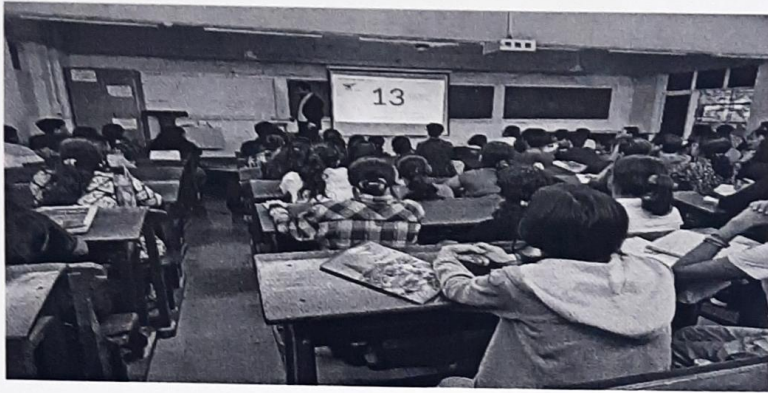
Students actively listening to the Speaker of the Event management