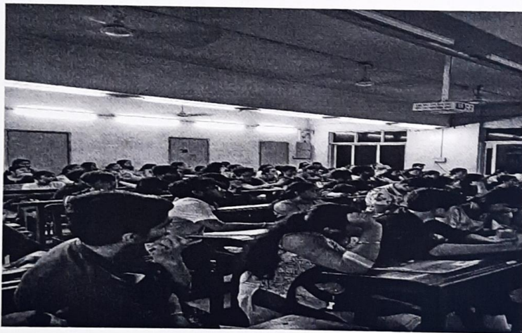
Students understanding the importance of Event Management